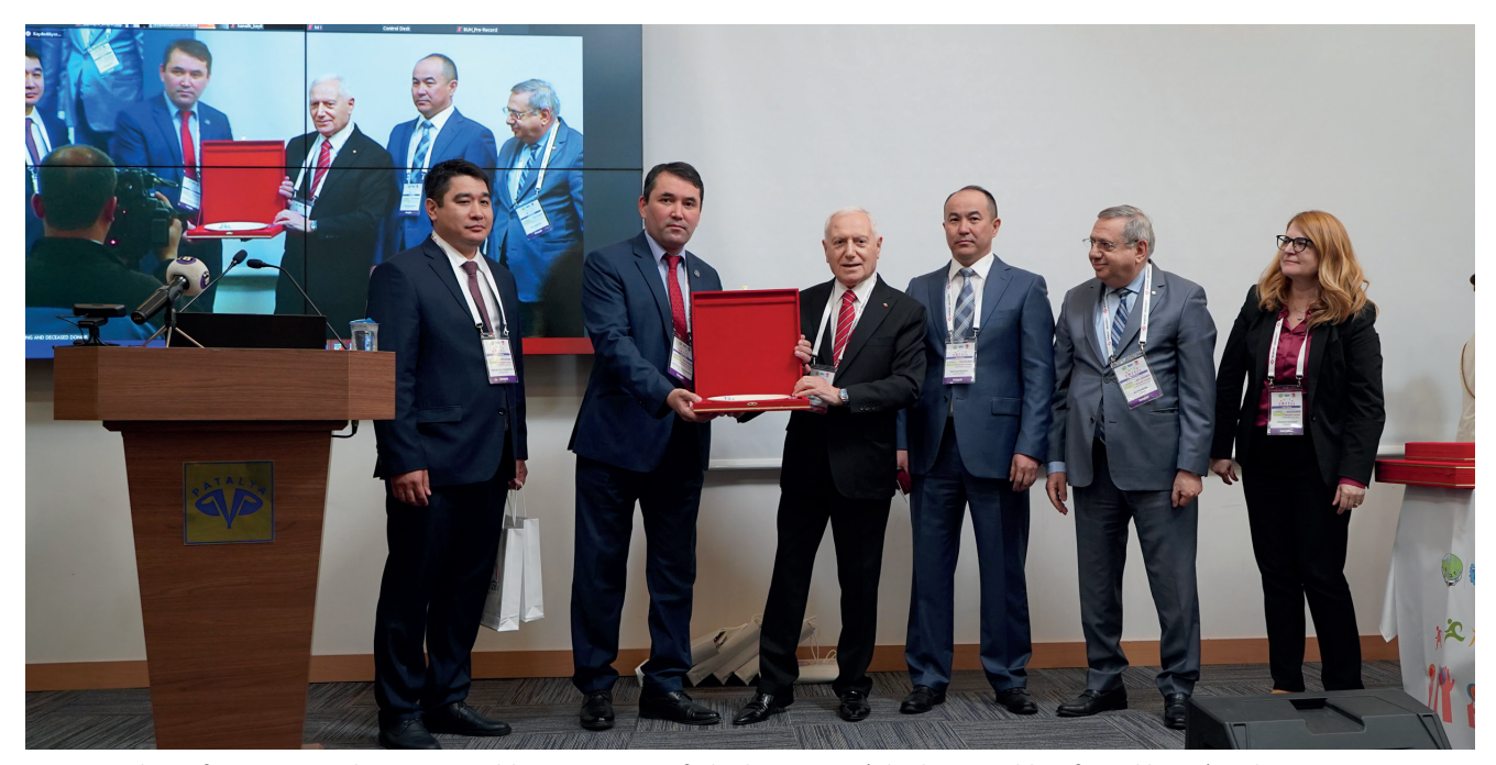
Memorandum of Cooperation between Health Department of Aktobe Region (Aktobe, Republic of Kazakhstan) and Başkent University (Ankara, Republic of Turkey)