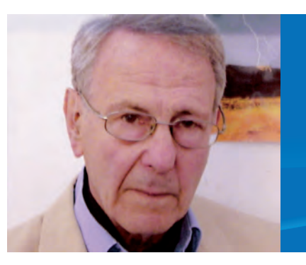
Immunologist Leslie Baruch Brent will be honored during the 2012 Berlin Congress

The main congress will offer a versatile and exciting scientific program spanning disciplines from clinical transplantation to basic science. Worldwide-established experts will present the latest results of their research in twenty-six Sunrise Symposia and thirty-seven State-of-the-Art Symposia, giving a comprehensive overview of the field of transplantation. Extraordinary highlights will be presented in six Plenary Sessions.