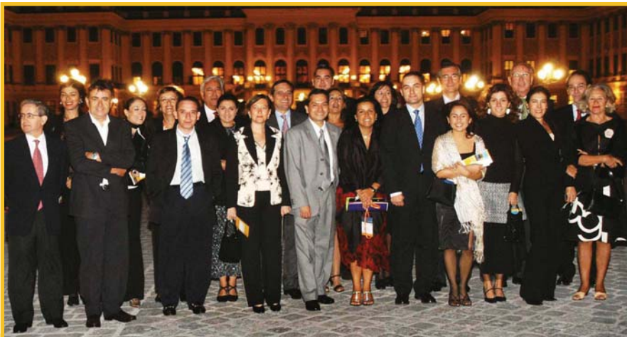
Vienna 2004 attendees in front of Schönbrunn Palace, the former summer residence of the Habsburg royal family.