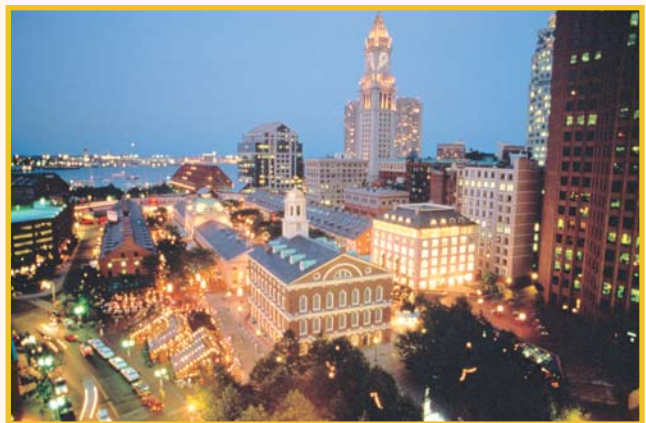
Boston's Faneuil Hall will be the location for the Gala Evening at the 2006 World Transplantation Congress next July