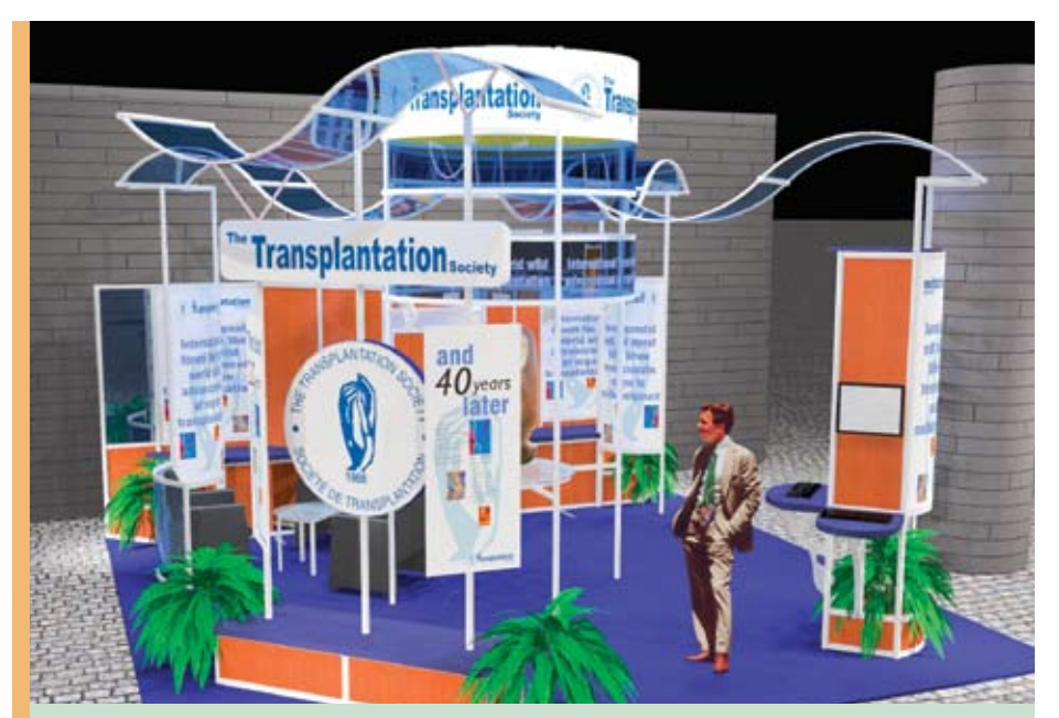
The TTS booth will be located in the main lobby of the Hynes Convention Centre near the Registration Hall.

Ten TTS-Astellas Young Investigator Awards will be presented to TTS members with the highest scoring abstracts during WTC.