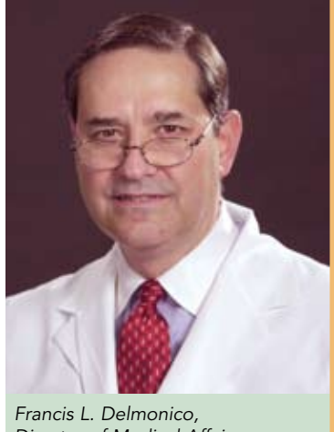
Director of Medical Affairs.