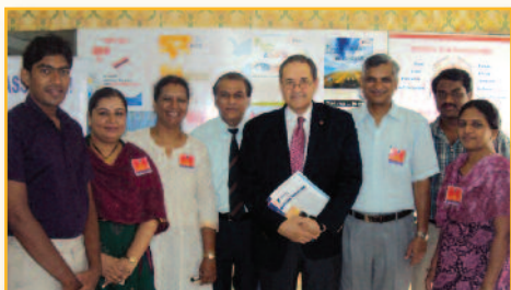
Members of the Mohan Foundation meet in Hyderabad with the goal of furthering deceased organ donation programs in India