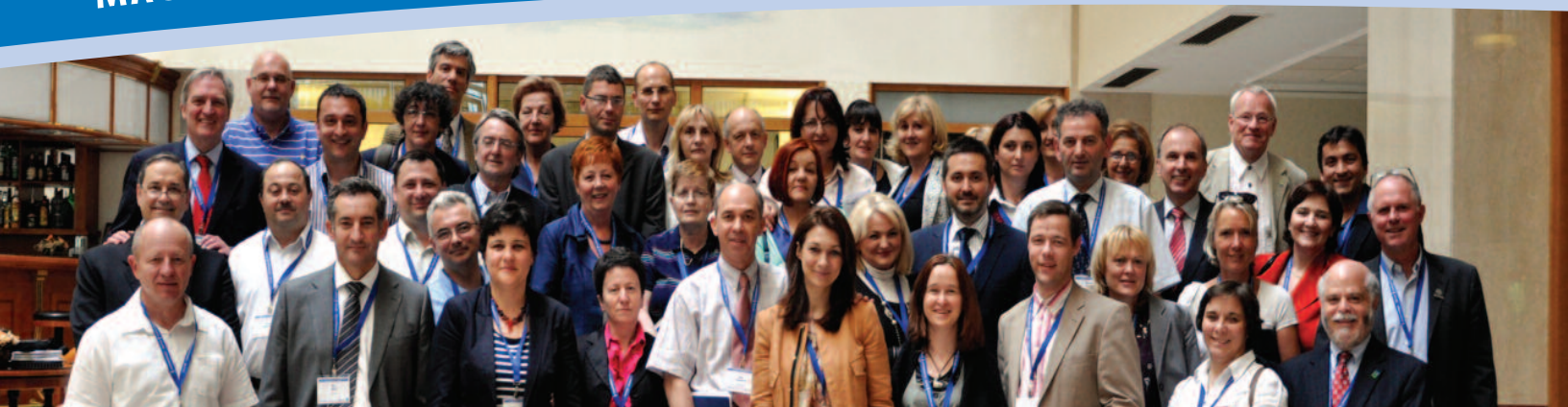
Participants of the collaborative meeting in Skopje, Macedonia in June 2011

The Transplantation Society (TTS) is collaborating with The European Society of Transplantation (ESOT), the International Society of Organ Donation and Procurement (ISODP) and the European Transplant Coordinators Organization (ETCO) to assist The Regional Health Development Center (RHDC) of Croatia in the development of deceased donation and ethically proper live donation throughout Southeastern Europe.