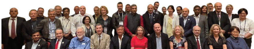
TTS 2024 Council Meeting