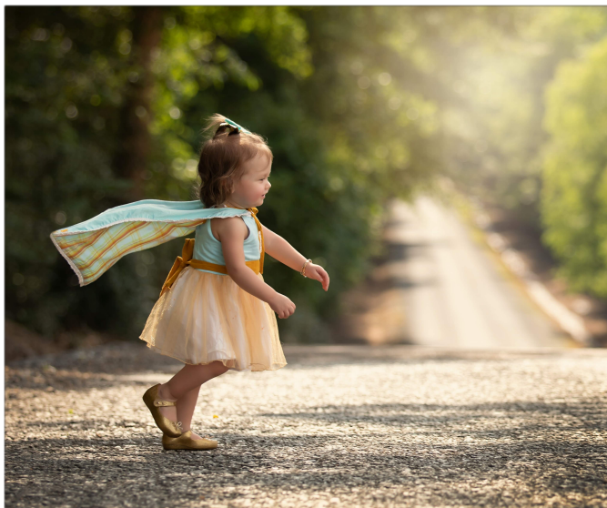
Adeline, transplant recipient on 2/20/2018