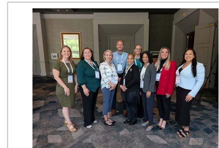
PFEP members; annual SPLIT conference

At the core of PFEP, we advocate for ourselves and for those without a voice. We advocate on relevant issues such as organ allocation, best practices and current challenges in the world of pediatric liver transplantation.