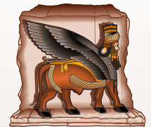
INTERNATIONAL XENOTRANSPLANTATION ASSOCIATION