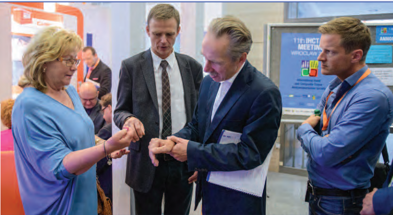
One of the three hand transplant recipients from the Wroclaw program who attended the 11 th IHCTAS Congress meets with meeting attendees to discuss her experience.