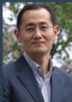
Dr. Shinya Yamanaka Wednesday, July 30, 2014