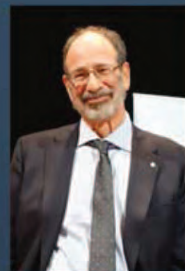
Dr. Alvin Roth Tuesday, July 29, 2014