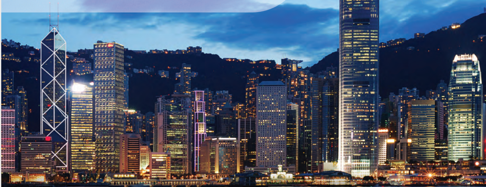
Hong Kong - site of TTS 2016

we will strive to develop better transplant outcomes for our patients and to bring transplantation to those regions where it is lacking