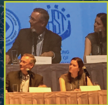
Young Member Committee events during the TTS 2016 Congress in Hong Kong