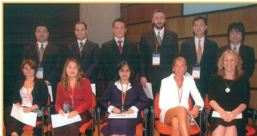
Recipients of the Young Investigator Award for 2004