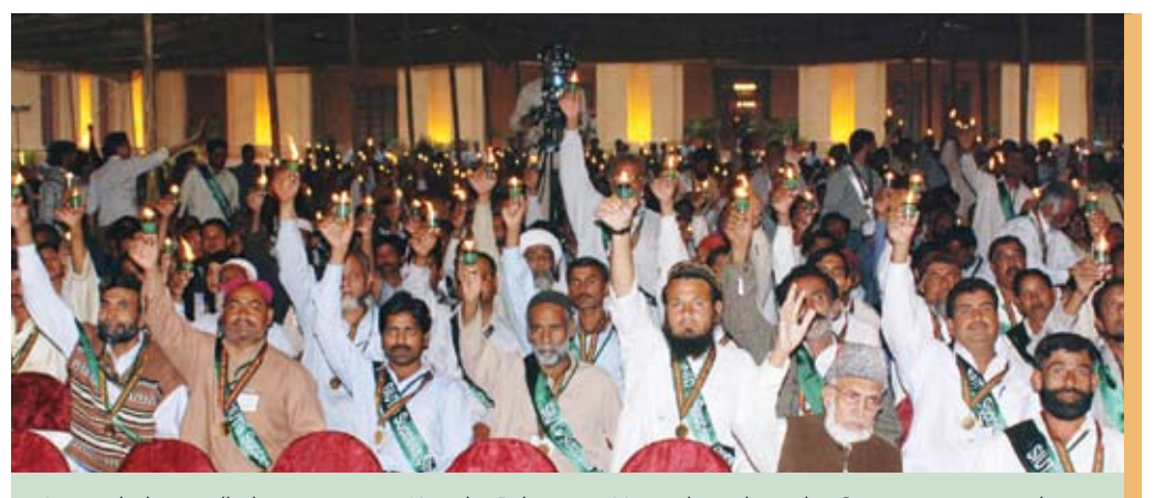
I attended a candle-lit ceremony in Karachi, Pakistan in November where the Governor presented medals to 700 live altruistic donors as a symbol of the country's gratitude. This was especially poignant, as Pakistan is a well-known site for the exploitation of poor people who are compelled to sell their kidneys. At this occasion, the Governor also read a letter from President Pervez Musharraf, which denounced the commercialization of organs and supported legislation to ban organ sales in Pakistan.