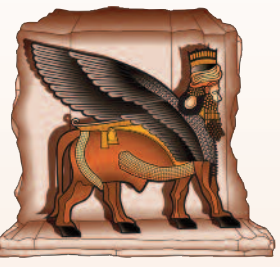
International Xenotransplantation Association

Xenotransplantation have jointly established a new annual Xeno Prize to be awarded, beginning in 2012, to the author of the best original paper published in the relevant year in Xenotransplantation. The Xeno Prize Committee will select the awardee from a list of candidates recommended by the journal's Associate Editors.